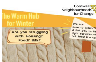
Warm Hub for Winter

Cornwall Neighbourhoods for Change can support you with fresh surplus fruit and veg weekly if you are facing hardship. Bags of essential groceries are available to people in crisis.